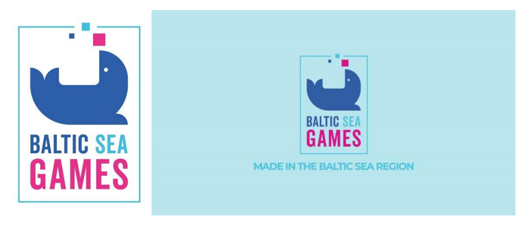
Picture 1: Baltic Sea Games logo; Picture 2: Baltic Sea Games logo with additional lettering

The Baltic Sea Games logo combines a playful atmosphere and levity with a visually memorable color scheme and catchy shapes. A seal and the " Baltic Sea Games " lettering are at the centre of the logo. The shape, size and layout of the logo allow for easy application in many different settings. Please find more examples of the logo application on Facebook<sup>41</sup>, Twitter<sup>42</sup>, WordPress<sup>43</sup> and YouTube<sup>44</sup>.